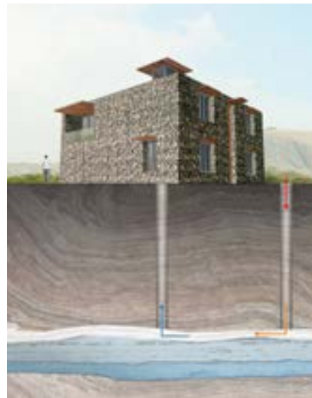
Proposals for prototypical dwellings encompass tower blocks in London and sustainable houses in Nigeria powered by geothermal energy.