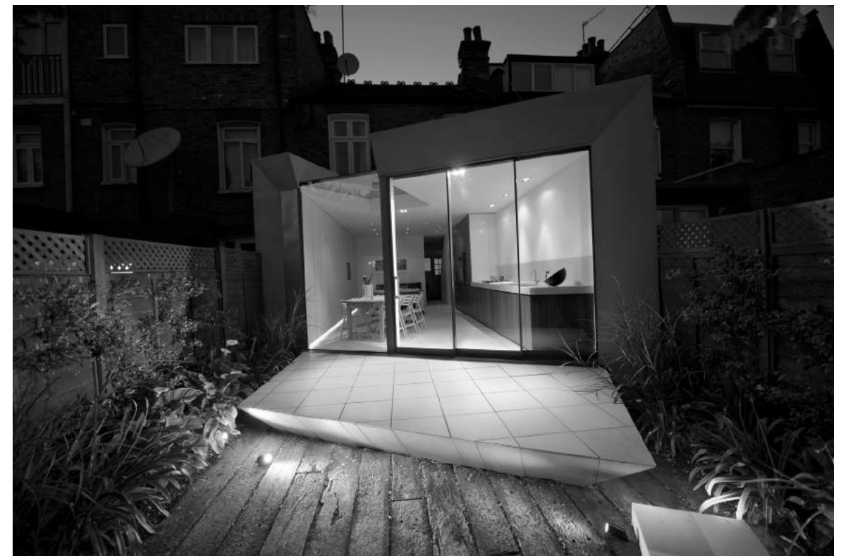
Night view of the sculptural facade and the floating deck.