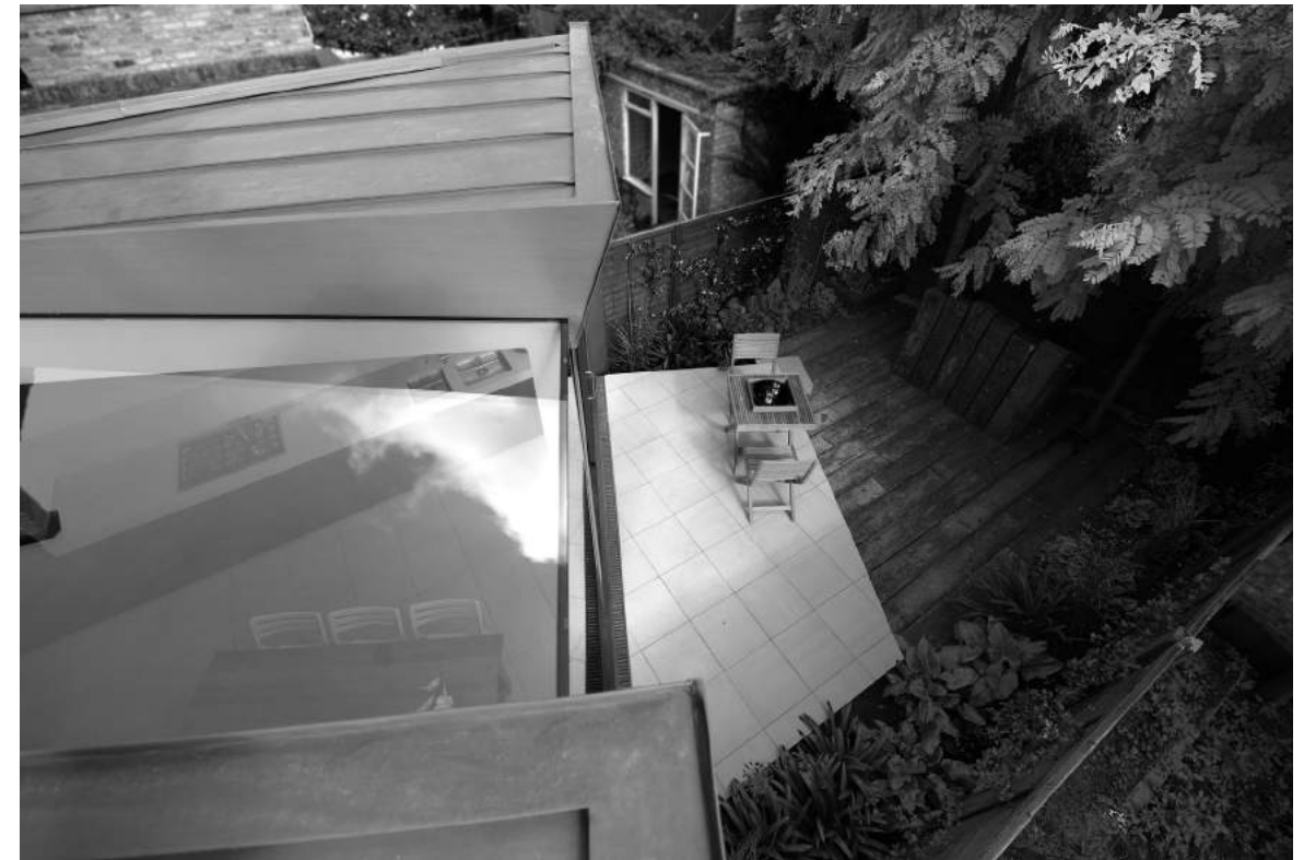
Birds eye view of the 30° faceted angle that allows the overlap between the indoor and outdoor spaces.

Faceted House 1, Alumni Project, Hammersmith, London