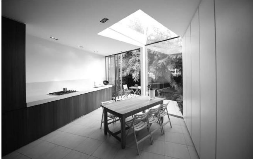
Clutter-free concept kitchen with sliding glass doors and frameless folded roof panel.

Paul McAnearney Architects have recently completed Faceted House 1; an Edwardian terrace house located within a conservation area, in Hammersmith, London. The project's brief was to remodel and extend the three-bedroom, two storey house that was in a decrepit state and in need of considerable refurbishment and modernisation. The client asked for a contemporary design and functionality and he also expressed the desire to be able to perceive the garden as a continuation of the domestic space rather than 'the outdoors'.